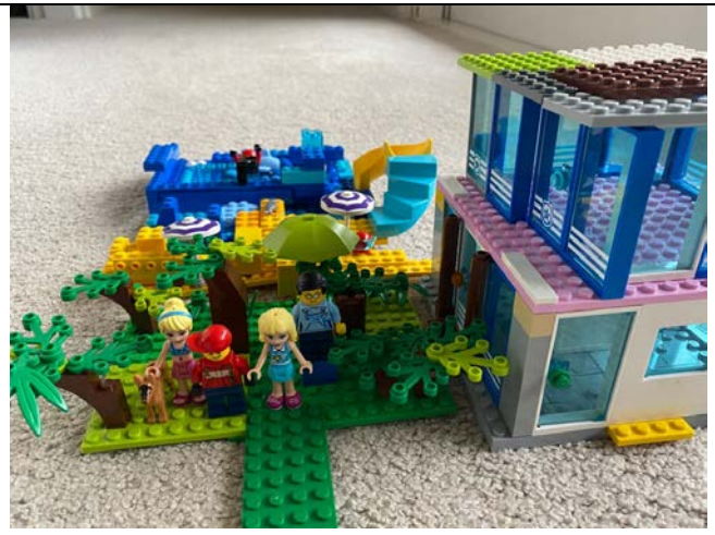
Family: A Family holiday in Hawaii