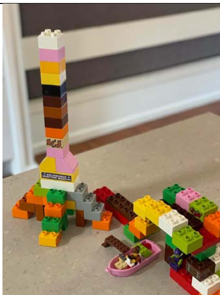
Bridge challenge: Thomas's Paris bridge with boat and troll going past the Eiffel Tower