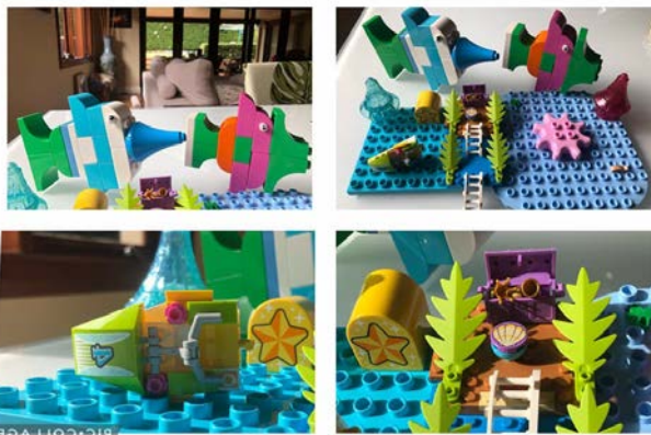
Under the sea: Victoria and Annabelle's deep water scene. Tropical fish, grand treasure chest full of gold treasures, seaweed and a sunken JetSki wreck.