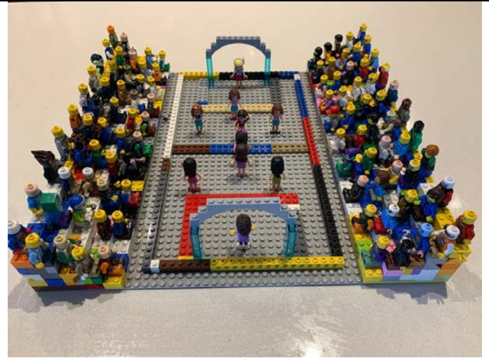
Sports challenge: The Matildas by Amber