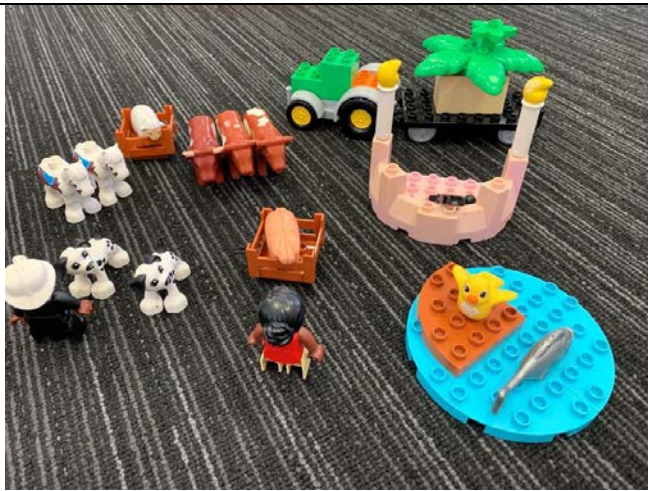
Movie set theme: Charlotte's Web