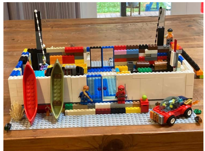
Dream House challenge: Noah and Patrick's Dream house for a 2 week covid lockdown!