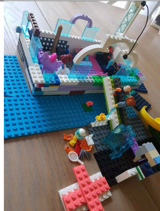
Fairy-tales: Holly's fairy queen castle surrounded by water and a bridge to a playground. They also have a carriage to take them to the village.