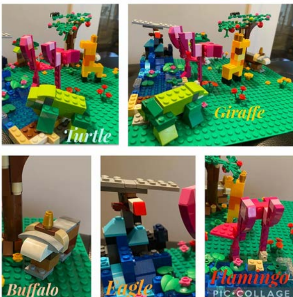
Aminal challenge: Ellie and Aiden's animal friends - Giraffe, Turtle, flamingo, Eagle and buffalo