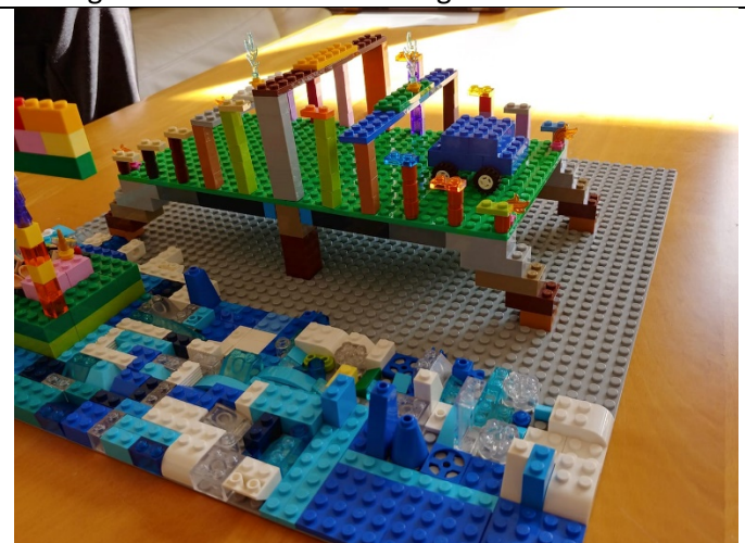
Bridge challenge: Eva and Melina's bridge with a car passing on it