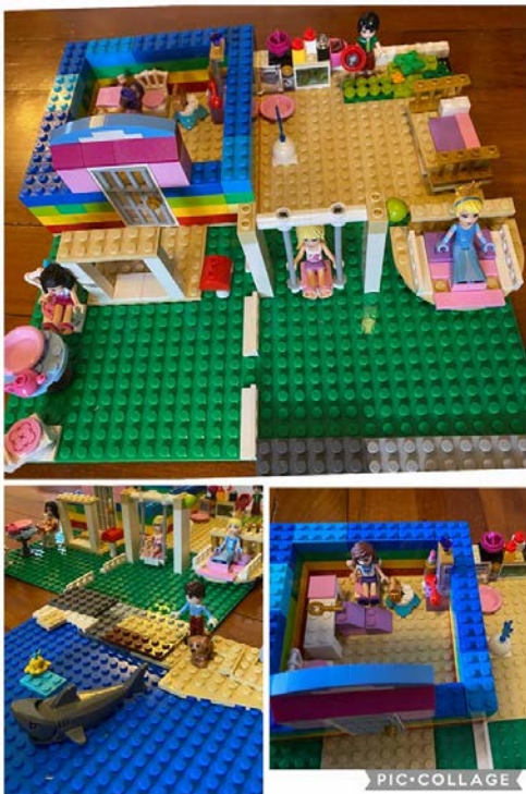
Ella and Aiden's Dream destination – their lockdown resort.